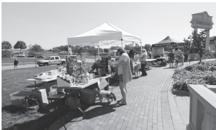
There is always a wide array of vendors – both pet and non-pet related!