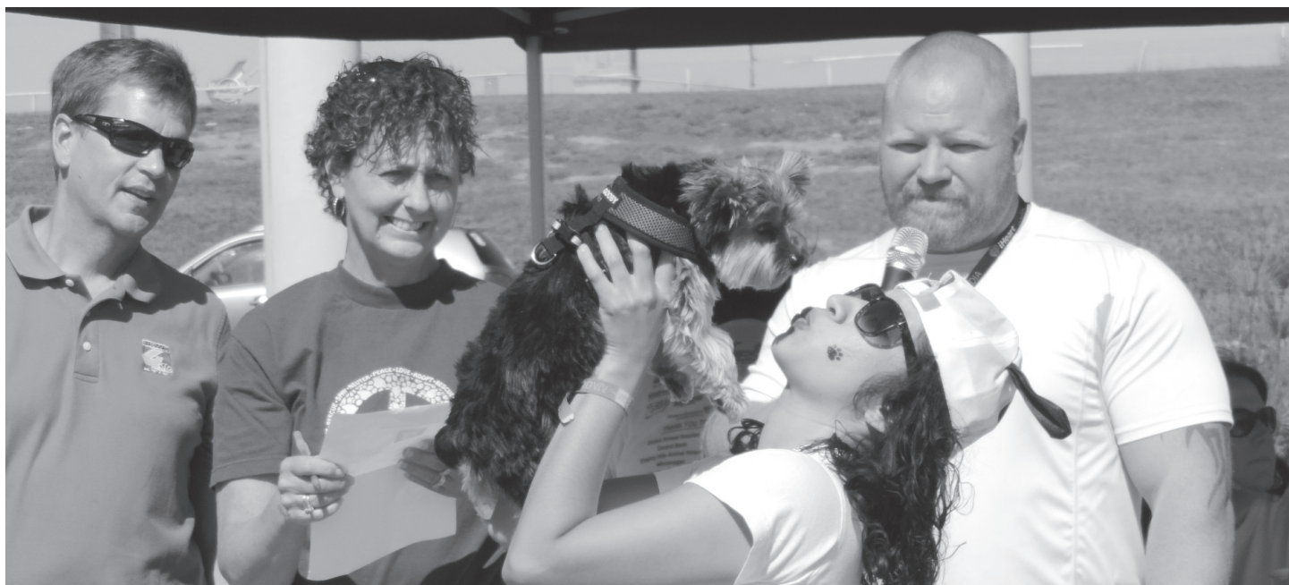
The pet contests always draw a crowd. Mc's and judges watch one of the best kisser contestants