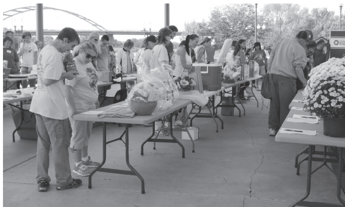
Get a great bargain at the silent auction. Wide variety of items for everyone to buy!