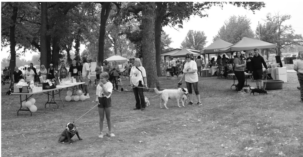
Bottom Right: The Sioux City Police Department demonstration was a huge hit with all the fans!