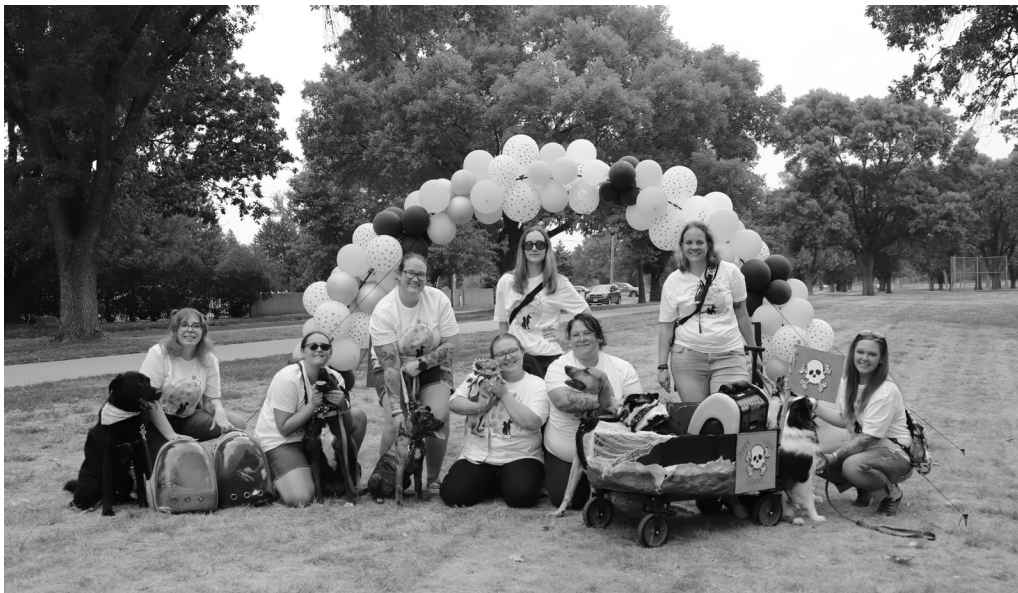
Top Left: The winning dog pack that raised the most money was Family Pet at Perry Creek and Morningside. A huge thank you to the veterinarians and staff for raising so much money!